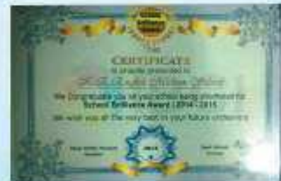
IBCI AWARD 2014-15 for Best Infrastructure & Resources