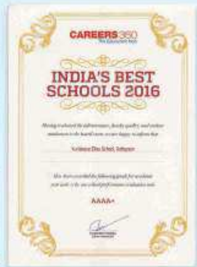
CAREERS 360 AWARD FOR India's Best School