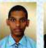
JEEB BABY JEEBIN MADRAS IT