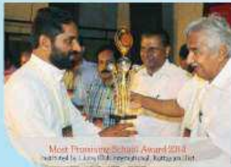
Most Promising School Award 2014 Instituted by: Lions Club International, Kottayam Unit