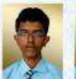
JUREED K.J. MADRAS IT