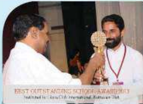
BEST OUTSTANDING SCHOOLS AWARDS 2013 Instituted by: Lions Club International, Kottayam Unit

KE School is proud to announce that our efforts in imparting quality education incorporated with humanitarian values and concern among the students were acknowledged and appreciated by noble establishments and persons.