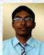
MANDACOPAN MADRAS IT SRM K J IN KERALA ENG. 475 IN IIT ADVANCED